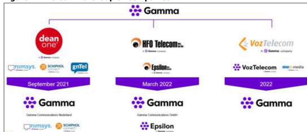
Figure 1: The Gamma Group of Companies

Today, Gamma employs a total of 1,650 people. Each of the acquisitions depicted in Figure 1 comprised no more than 150 employees. Each acquired company's own mix of telecom and IT assets was unique. Their approaches to cyber security were all unique, albeit they all needed maturing. Having to reconcile conflicting realities – increasing cyber threats, increasingly stringent cyber security regulation of the telecom sector (such as the UK's new Telecom Security Act) but nevertheless real-world budget limitations – Gamma arrived at a new group cyber security strategy earlier this year.